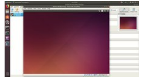
Running Ubuntu Live CD under VirtualBox on Ubuntu

Users of VirtualBox can load multiple guest OSes under a single host operating-system (host OS). Each guest can be started, paused and stopped independently within its own virtual machine (VM). The user can independently configure each VM and run it under a choice of software-based virtualization or hardware assisted virtualization if the underlying host hardware supports this. The host OS and guest OSs and applications can communicate with each other through a number of mechanisms including a common clipboard and a virtualized network facility. Guest VMs can also directly communicate with each other if configured to do so. [31]